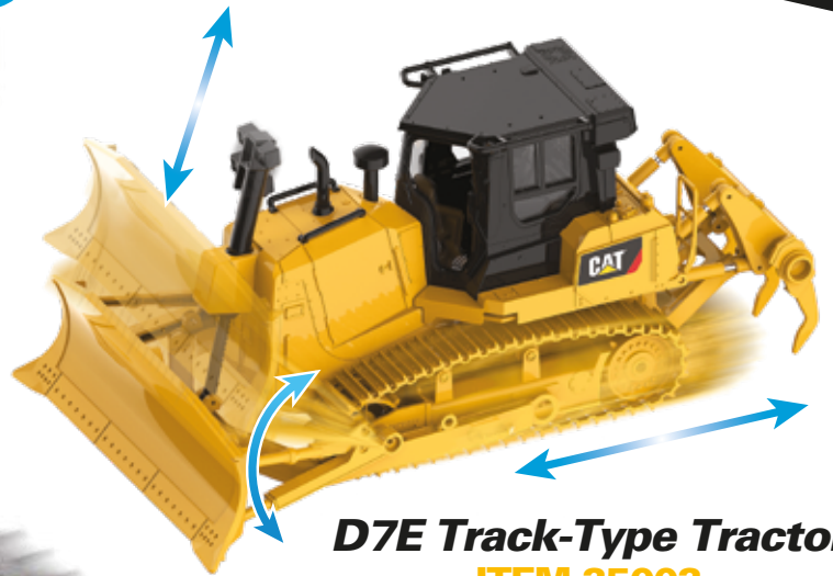
D7E Track-Type Tractor ITEM 25002