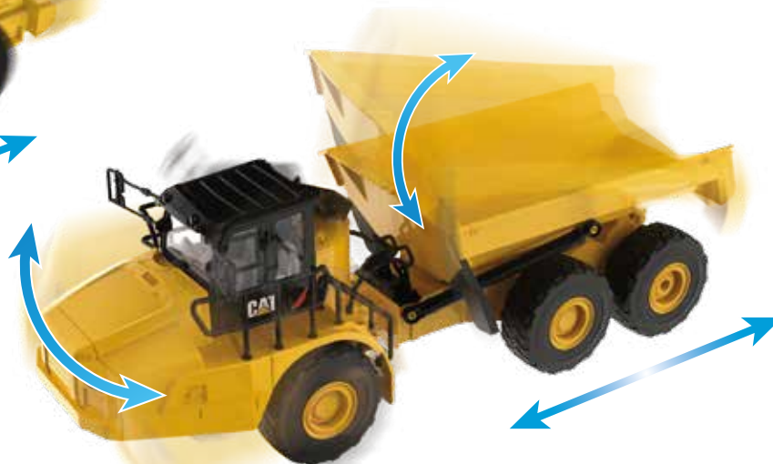
745 Articulated Truck ITEM 25004

8+ Diecast Masters scale models are adult collectibles, not toys. Not intended for children under 8.