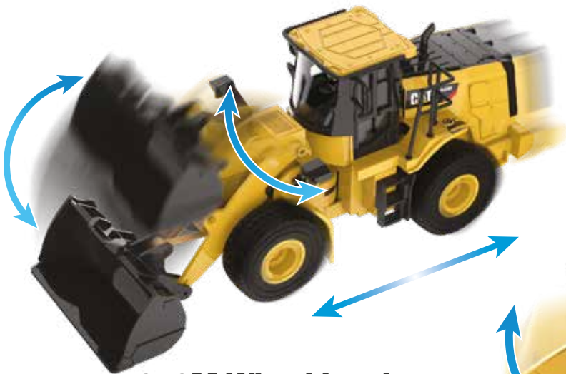
950M Wheel Loader ITEM 25003