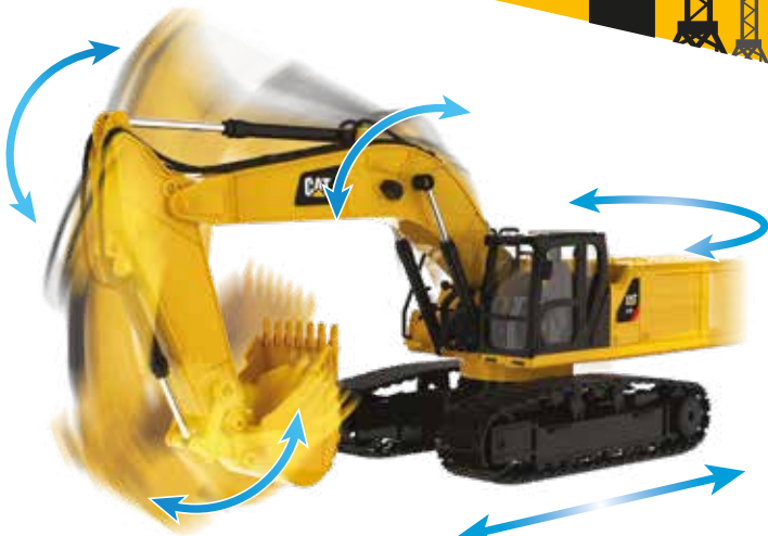
336 Hydraulic Excavator ITEM 25001